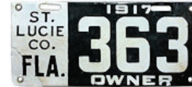
1917, St. Lucie Co.