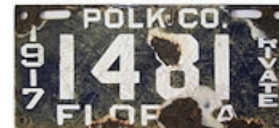
1917, Polk Co.