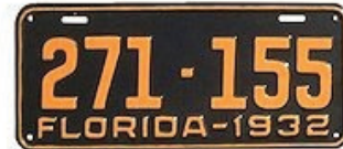
1932, orange on black