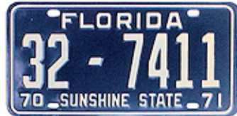
1970-1971, white on blue