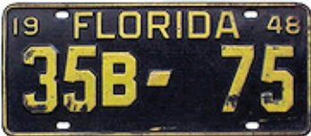
1948, yellow on black