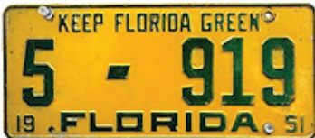
1951, green on yellow