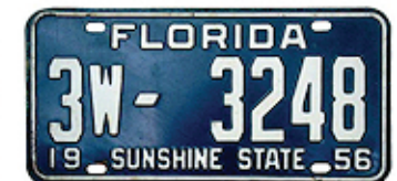
1956, white on blue