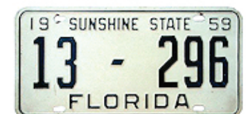
1959, dark green on white