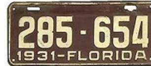
1931, white on maroon