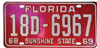
1968-1969, white on red