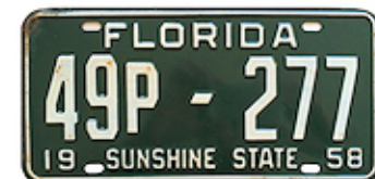
1958, white on dark green