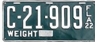
1922, white on green (2)