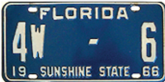
1966, white on blue