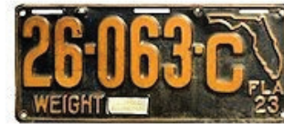
1923, orange on dark blue