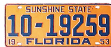
1953, blue on orange