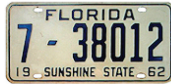
1962, blue on white