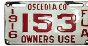
1916, Osceola Co.