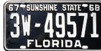
1967-1968, white on black