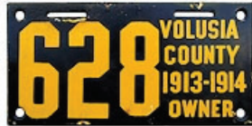
1913 - 1914, Volusia Co.