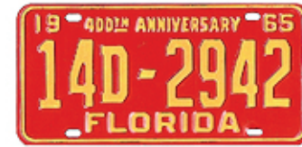
1965, yellow on red