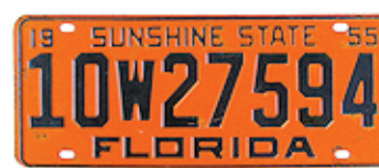
1955, blue on orange