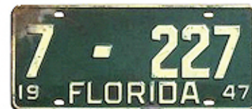
1947, white on green