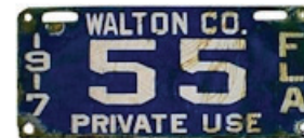
1917, Walton Co.