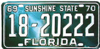
1969-1970, white on green