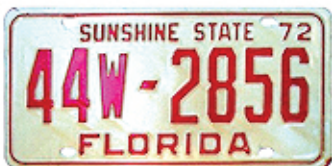
1972, red on white