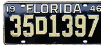
1946, white on dark blue