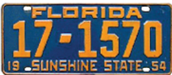
1954, orange on blue