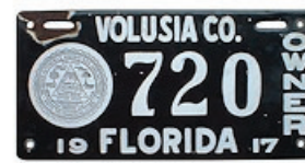
1917, Volusia Co.