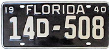
1940, white on black