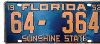
1952, orange on blue