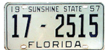
1957, blue on white