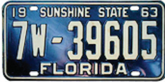
1963, white on blue