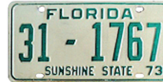
1973, green on white