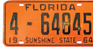
1964, blue on orange