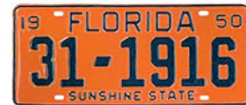
1950, blue on orange