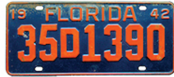
1942, orange on blue