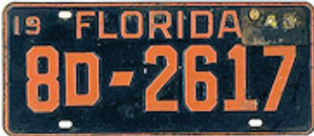
1942, orange on blue and 1943 yellow on blue tab