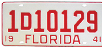
1941, red on white