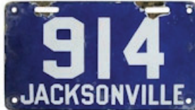
1911 - 1915, Jacksonville