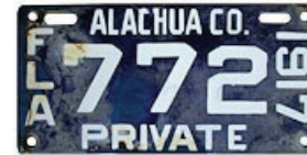
1917, Alachua Co.