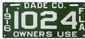
1916, Dade Co.