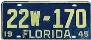
1945, yellow on black