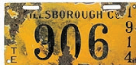
1914, Hillsborough Co.