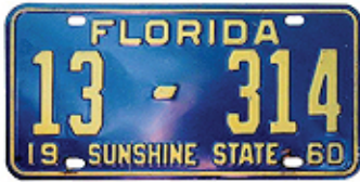
1960, yellow on blue