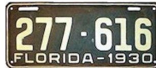
1930, white on green