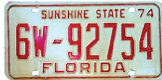
1974, red on white