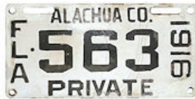
1916, Alachua Co.